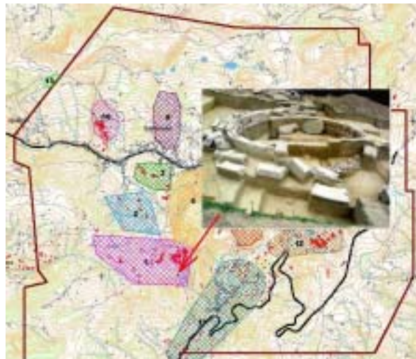
Fig. 4 The location of Circular Monument within the site “Găuri – Hop – Hăbad - Tăul Țapului”

When we select the monument will appear his location on the site, the characteristic data and the locate the four graves.