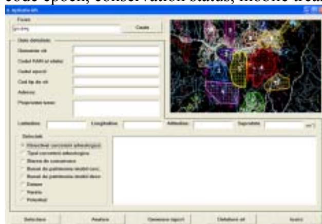
Fig. 1 Application interface

For “Area” level of the application were taken into account all the thirteen archaeological sites from Roșia Montană. It was made a database in Microsoft Access. The database contains data on site location (territorial administrative unit, city, geographical landmarks, hidrographical landmarks, latitude, longitude, altitude), the legal situation of the site, area, type of research, code epoch, conservation status, mobile treasures found.